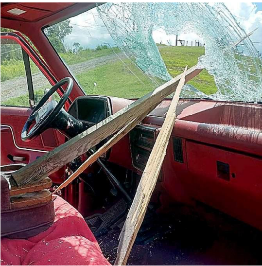
First tornado in Greene County in nearly three decades damages home